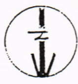
EXHIBIT "A" (1 of 2)